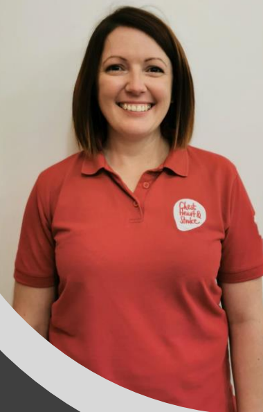
The 'Techies' Team